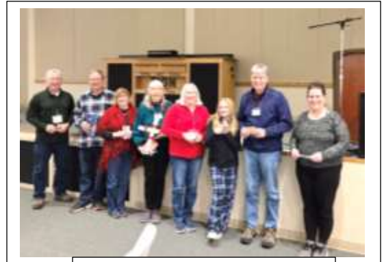
The biggest winners & losers