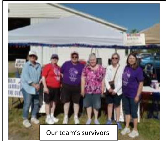
Our team's survivors