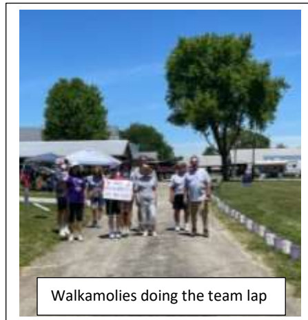
Walkamolies doing the team lap