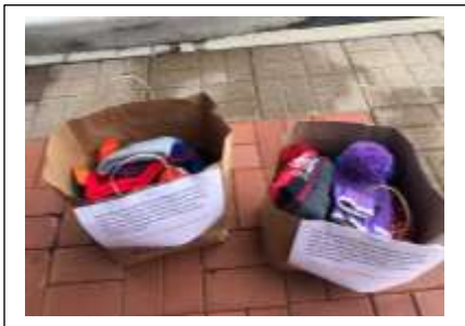
2 Bags of donated hats & gloves