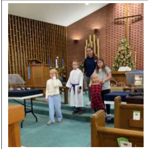
First Week - Hope