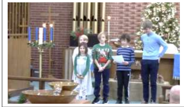
Second Week - Peace