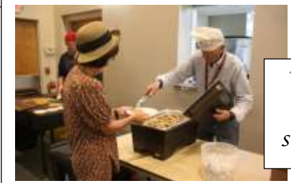
Volunteers are the heart and soul of ministry.