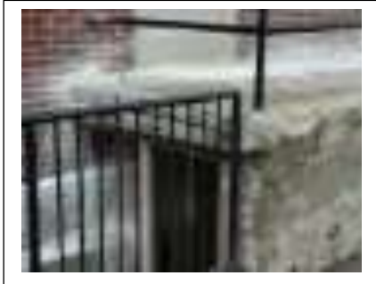
Old broken ramp