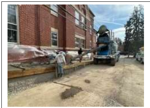
Pouring the new