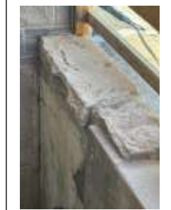
Finishing touch... 1894 Step in place