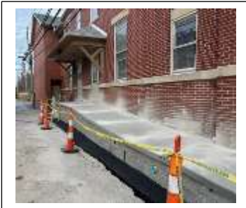
Backfilled alley & expansion joints