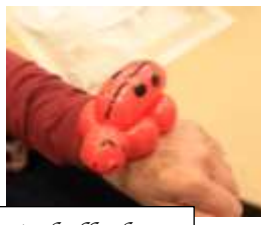
Zion is full of members who make a difference in the world!