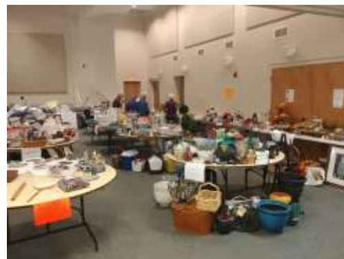
Treasures galore filled the hallway and fellowship hall.