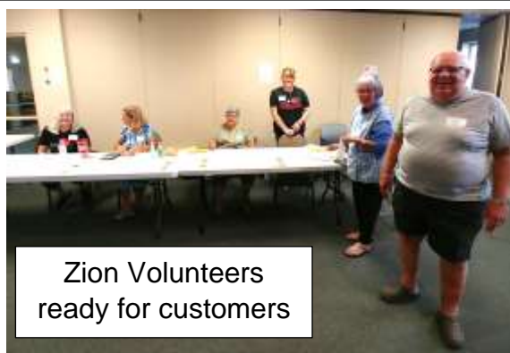
Zion Volunteers ready for customers