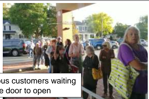
Anxious customers waiting for the door to open