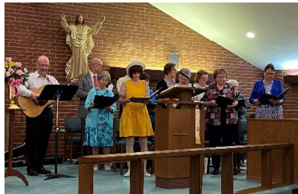
Zion Chancel Choir