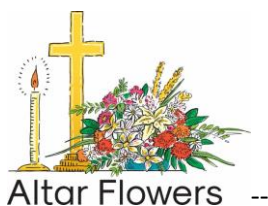
Altar Flowers --

As a side note: If you have taken home altar flowers (either in white containers or coffee cans), please make sure to return the containers.