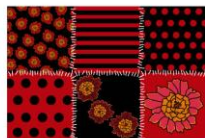
National Quilting Day

If you didn't have a chance to attend the quilting open house, stop by any time! Quilters are usually at work on Tuesday mornings, 10 am – noon, and Monday morning quilting will resume soon (TBA). If you are interested in volunteering, please come! We have a variety of job options-some include sewing skills, but there is plenty to do that don't. It's a great social time, but we also make a lot of quilts. Work can be done during the time we are together or you can pick up some things to do at home.