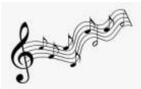
Musical Notes by Lori Sebastian

With St. Patrick's Day in March, I pulled out some Celtic music books. I am not a Western European scholar, so when I considered what Celtic music referenced, I thought primarily Irish music. However, upon further research, I learned historically Celts occupied a good bit of Western Europe. Modern day when we think of Celts, it refers to 6 specific regions: Ireland, Scotland, Wales, and 3 other areas: Cornwall (a ceremonial